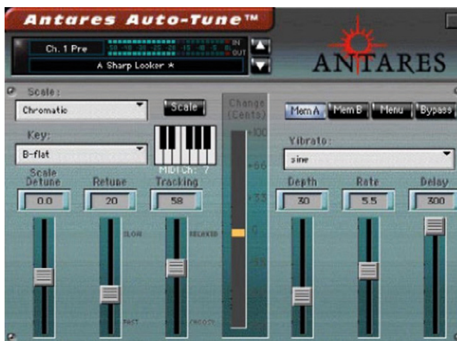
Early version of Antares Auto-Tune, c. 1997

the years, labelled as cheating and fooling listeners into 'believing' an artist is better than they are.